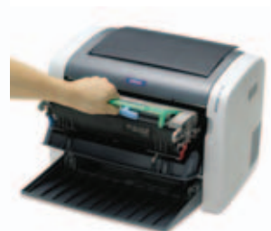
Easy access, front loading consumables

To enable simple configuration, monitoring and management across your network, the EPSON EPL-6200 is easy to use and available with EpsonNet configuration and monitoring tools*.