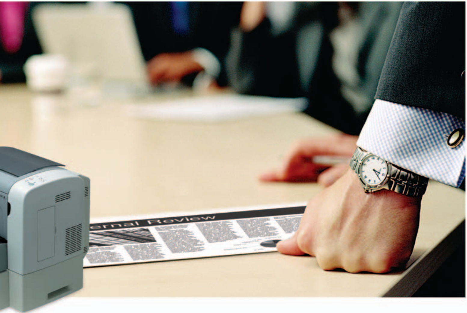
EPSON EPL-6200 with additional 500 sheet tray and duplex unit