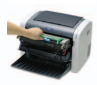
Easy access, front loading consumables

To enable simple configuration, monitoring and management across your network, the EPSON EPL-6200 is easy to use and available with EpsonNet configuration and monitoring tools*.