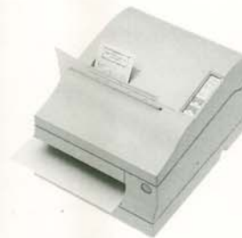
1.5 Station Printer TM-U925

Using the EPSON OCX Driver for the TM-U950 will allow you to reduce time and money spent on developing POS application software.