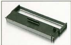
ERC-31 (purple, black)